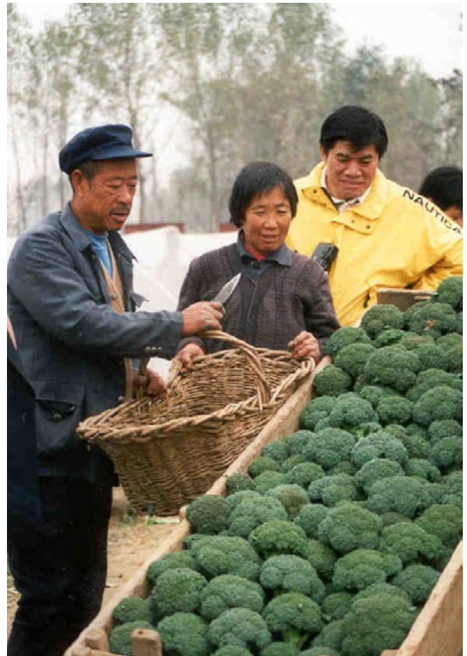
Broccoli in Shandong, China.

The number of organisations has gone down in the United States from seventy-one year 2004 to sixty year 2005. When the NOP was passed, there was a rush for organisations to register as certification bodies, similar to what happened in the EU in the mid-nineties. Some were never accredited, and some may not have been certification bodies. Others realised that there is not much money to be made from organic certification. In Europe, there has been an increase in the number of certification bodies in Spain, Italy, and some new EU member states. In Latin America, five certification bodies in Colombia have been added to the listing, bringing the total to six. The most spectacular increase has been in China, where the number went from six in 2004 to twenty-six in 2005. This growth is likely an effect of the introduction of legislation for organic farming in China.